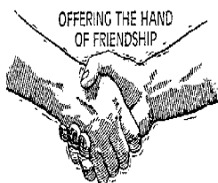
OFFERING THE HAND OF FRIENDSHIP

Mother Teresa of Calcutta reminds us "Every time you smile at someone, it is an action of love, a gift to that person, a beautiful thing." May our welcoming approach to one another be the smile we all need. The joy of Easter is that we all have something to smile about—for Christ is truly risen and dwells among us in His Spirit and in this, our parish family.